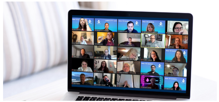
First day of the 2021 Water 101 Academy.