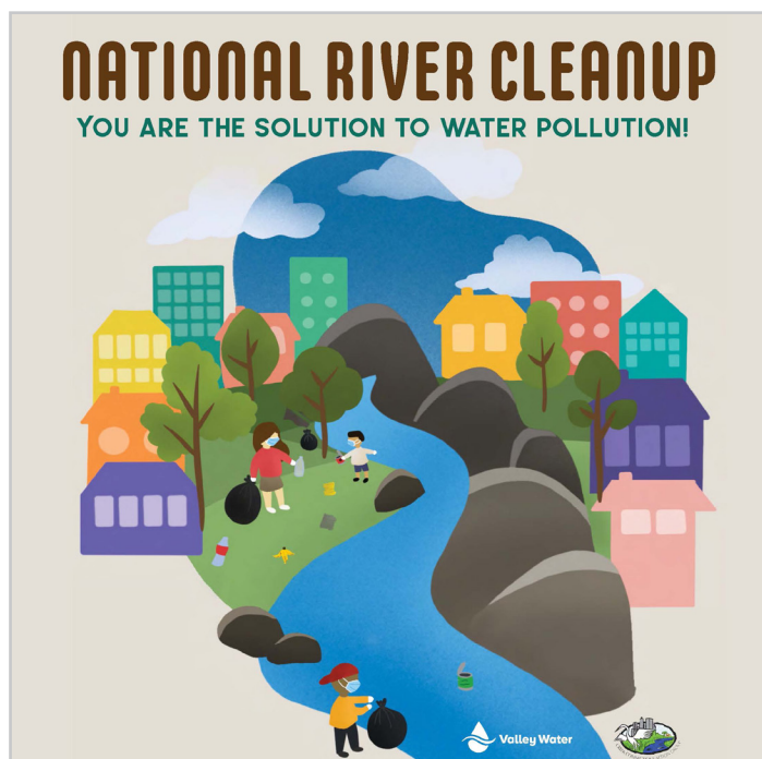
Be the Solution to Water Pollution and consider volunteering.