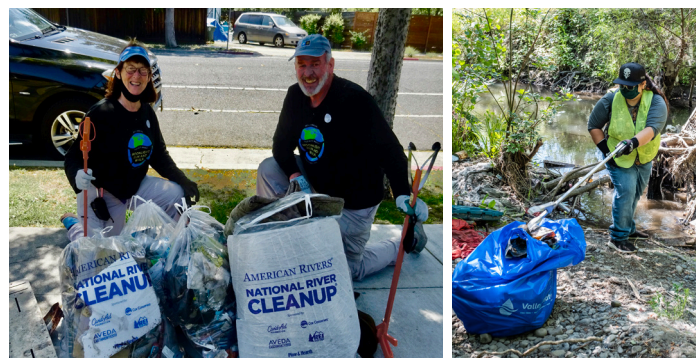
Volunteers cleaned up their local neighborhood to support National River Cleanup month and the Coyote Creek Cleanup.