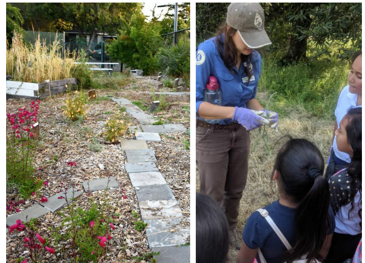
LEFT: The Capri School Native Habitat Garden provides wildlife habitat and an outdoor learning laboratory for young students. RIGHT: Girl Scouts Green by Nature Project - scouts learning leadership skills through environmental stewardship projects

Safe, Clean Water Grant Closeout: Girl Scouts of Northern California's Green by Nature Project. In FY2018, Valley Water awarded Girl Scouts of Northern California a $16,951 B7 Grant to implement a 12-week environmental outreach and education program called "Don't Waste That Watershed," which served 267 girls at seven different school sites in Santa Clara County. The project included eight 90-minute learning sessions, nature-based field trips, a local community service project, leadership-building activities, and a family engagement event. As a result, 80% of participants plan to protect the environment and encourage others to do the same, demonstrating environmental stewardship.