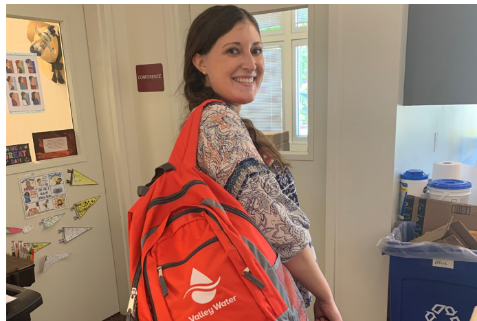
Backpack winner from Monta Loma Elementary School

FY21 Goal: Reach at least 10,000 students and 1,500 members of the public.