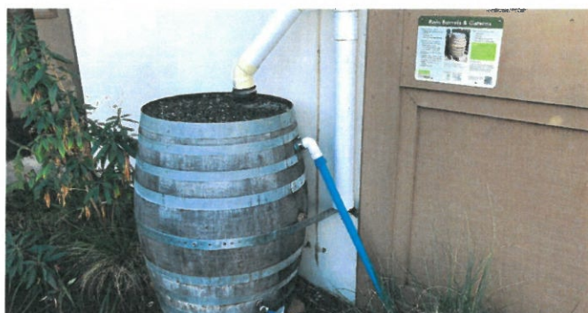
Rail barrel installed in Palo Alto by Grassroots Ecology as part of the Greening Urban Watersheds project funded by Valley Water.