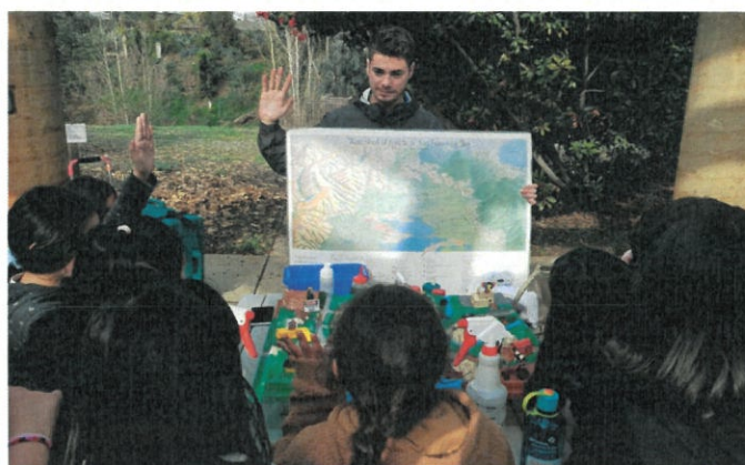
Girl Scouts learn about watershed stewardship at Coyote Creek Outdoor Classroom.