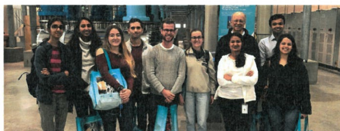
UC Berkeley environmental engineering graduate students on a SVAWPC tour.