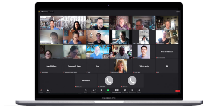
Water Ambassador's quarterly working meeting on August 18

On August 18, staff hosted the Water Ambassadors for their first quarterly meeting of fiscal year 2021. Attendees learned about the newly adopted Climate Change Action Plan and current drought emergency. After the presentation, they brainstormed ways to support water conservation and amplify drought messaging within their communities. In attendance were ambassadors from all three Water 101 cohorts (2019, 2020, and 2021). In addition, staff developed and implemented an annual Water Ambassadors survey to gather participant feedback to inform future program planning.