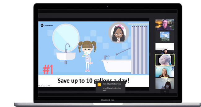
Wonders of Water Wednesday attendees learn about saving water.

FY22 Goal: Reach at least 10,000 students and 1,000 members of the public.