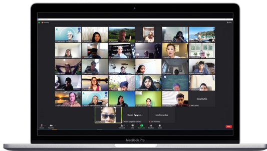
Youth Commission Meeting on August 25, 2021.