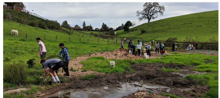
Grassroots Ecology's Westwind Barn Stormwater Infiltration Project: Volunteers played an instrumental role in clearing invasive plants and growing, planting and caring for native plants.

Grant Closeout: Grassroots Ecology's Westwind Barn Stormwater Infiltration Project. In FY 2018, Valley Water awarded Grassroots Ecology a $70,605.60 B3 grant for their Westwind Barn Stormwater Infiltration Project. The grant funded environmental stewardship activities to increase stormwater infiltration at the Westwind Community Barn in the upper Adobe Creek Watershed in Los Altos Hills. The project engaged 628 volunteers to install a series of berms and contour plantings to slow and treat surface runoff to safeguard Moody Creek from polluted runoff. Activities included native plant installation and maintenance, invasive plant removal, regenerating riparian habitats, and taught volunteers how to grow, plant, and care for native plants.