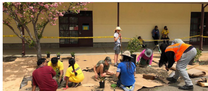
Living Classroom's Crittenden Middle School Native Plant Garden Project: Volunteers help install a 2,300 sqft native plant garden for students.

Grant Closeout: Living Classroom's Crittenden Middle School Native Plant Garden Project. In FY 2017, Valley Water awarded Living Classroom a $5,000 D3 Mini-Grant for their Crittenden Middle School Native Plant Garden Project. The grant funded the installation of a 2,300 sq. ft. native plant garden with 75 native plants and serves as an outdoor classroom to provide environmentally focused lessons to students.