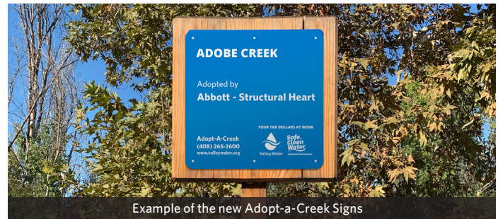
Example of the new Adopt-a-Creek Signs

In August, staff wrapped up our revamp of the Adopt-A-Creek signs. In the fall, Valley Water staff will remove 26 outdated signs and place 55 new signs with the new Safe, Clean Water logo for all current Adopt-A-Creek partners.